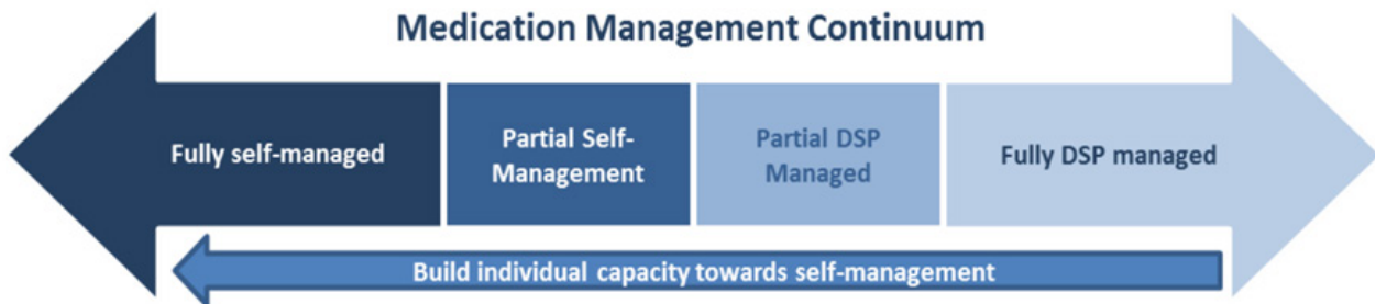
Figure 2: Medication Management Framework from the Tasmanian Disability Services Framework

prescribing and dispensing of medication and accessing physical support to take medication or reminded on medication dose timings.